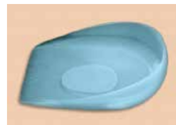
Heel pads provide extra support

Night splints. Because your fascia tightens up overnight, your doctor may prescribe a night splint to help ease morning heel pain. This splint stretches the Achilles tendon, the plantar fascia, or both while you sleep.